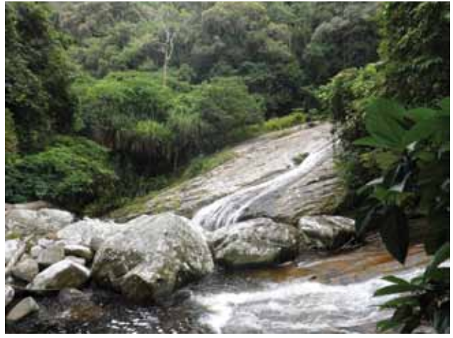
The meeting of the Chazi and Mlangali Rivers

This trail starts at Mhonda Village and passes through Kwelikwiji, Mafuta and then Ubiri Villages. From Mhonda Village, the trail passes through farms and then up into the forest where it follows a ridge. The walk takes 7 hours at a steady pace. The trail passes through intact, evergreen forest passing the pool at the meeting point of the Chazi and Mlangali rivers and the 7-chambered Malolo Cave finally reaching the dramatic 200 metre high Lusingiso waterfalls. From the falls, visitors can proceed to the camp site at Mafuta Village (approximately I hr from the falls). As none of these trails are marked on the ground, it is essential that visitors are accompanied by a local guide